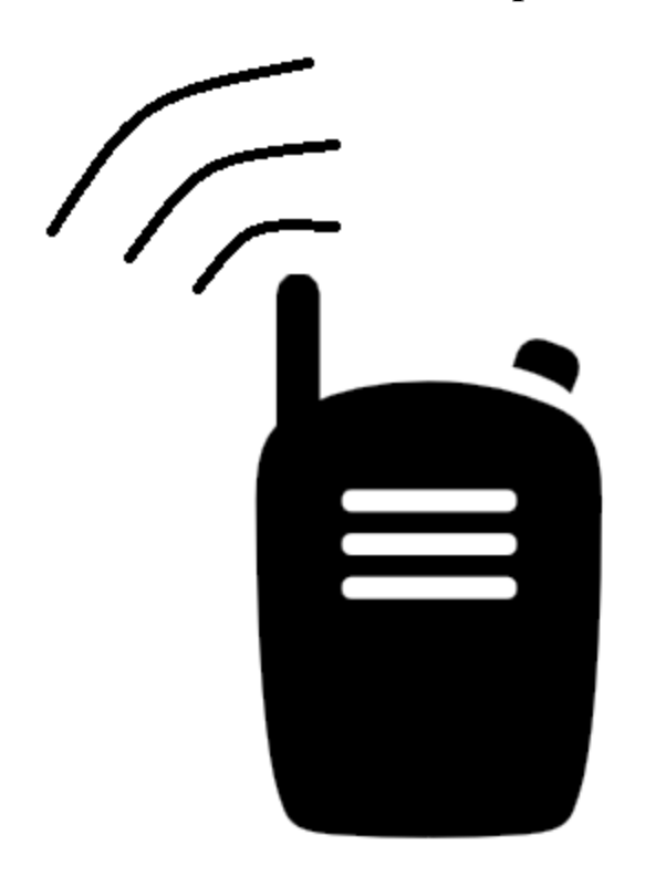
Radio System Installed